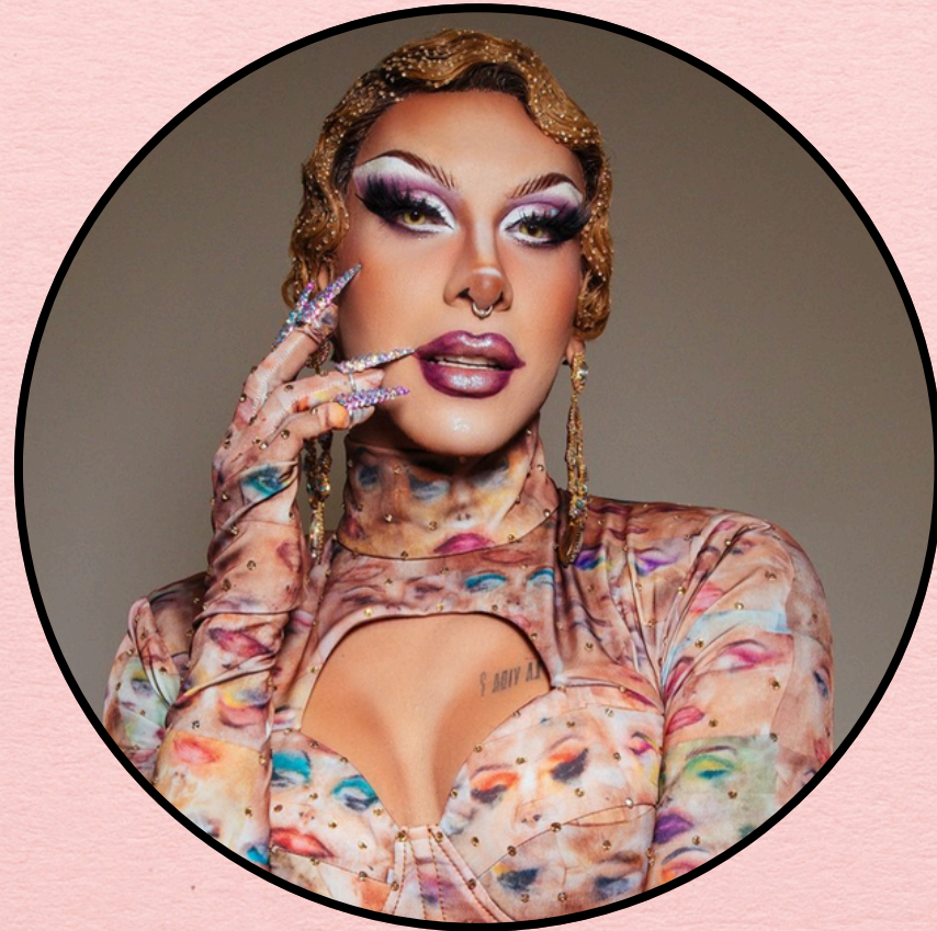
EVA BLUNT Drag Race Mexico Las Mas Dragas